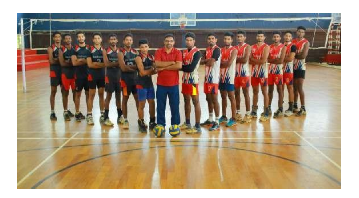
M. A. Volleyball Academy