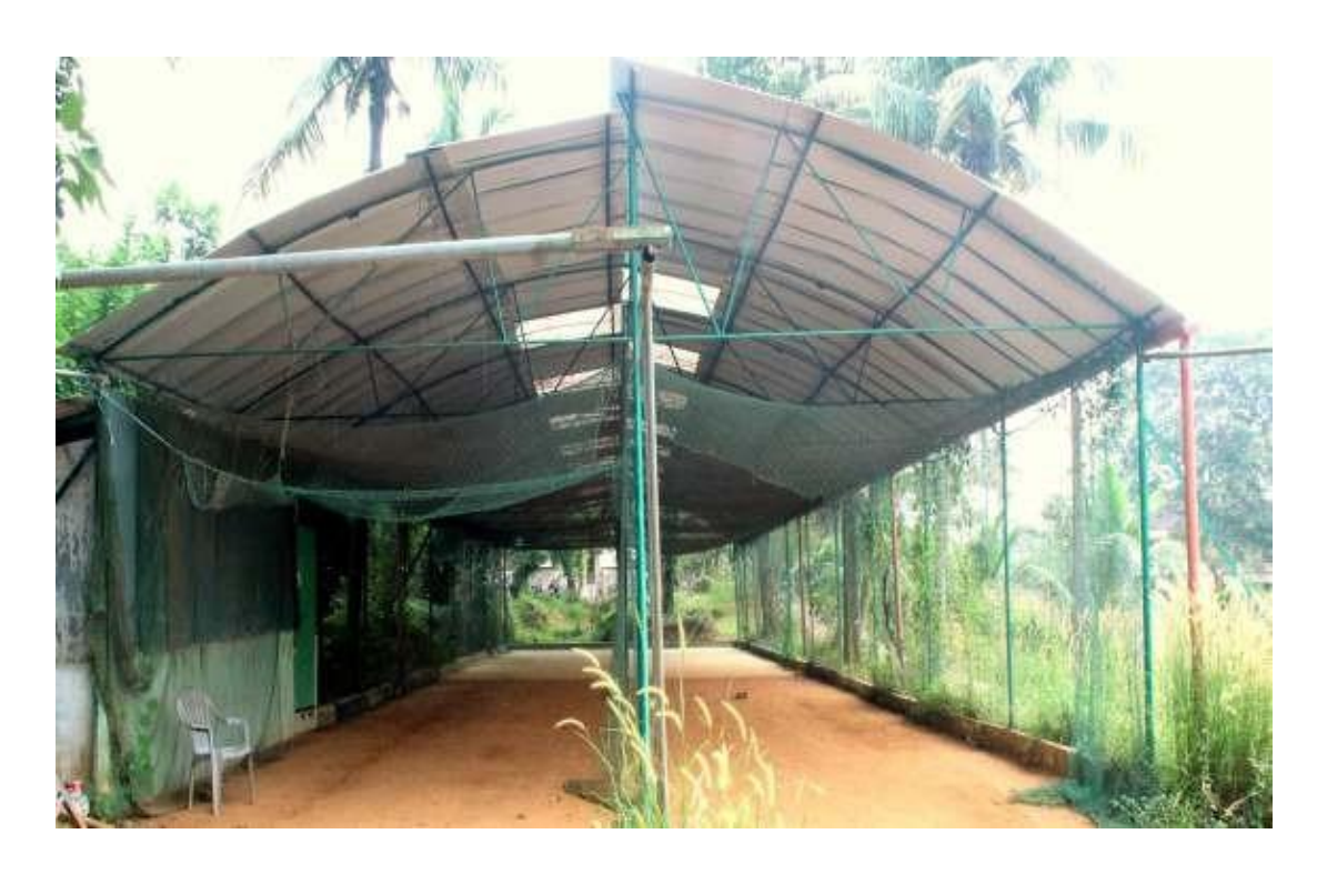
Cricket Indoor Nets